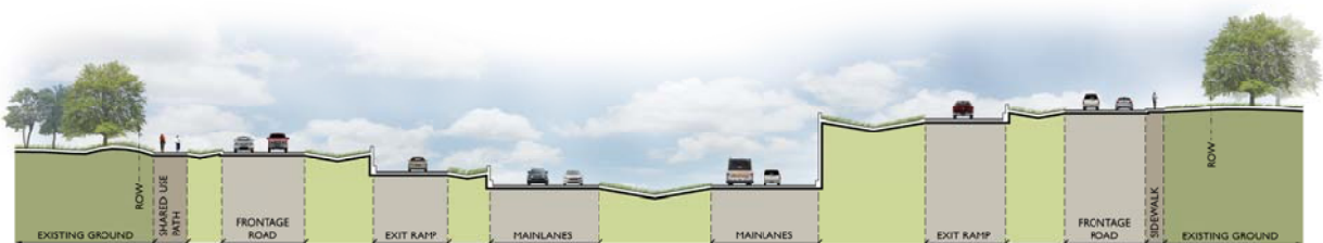
TYPICAL SECTION FROM ALTERNATIVE A US 290 near RM 1826